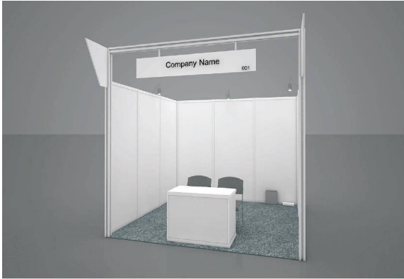
Design – 1: EUR 40/m 2