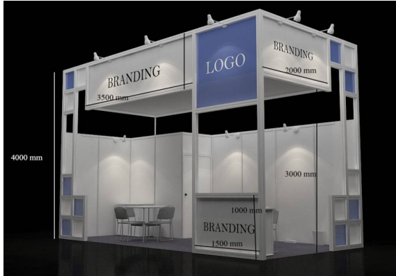
Design – 3: EUR 85/m 2