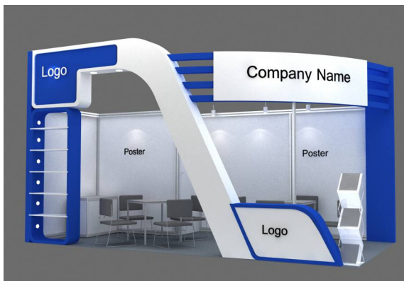
Design – 4: EUR 144/m 2

The design may vary if the stand size or number of sides open differ.