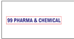
99 Pharma & Chemical