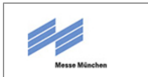
Messe Muenchen India