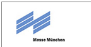
Messe München GmbH